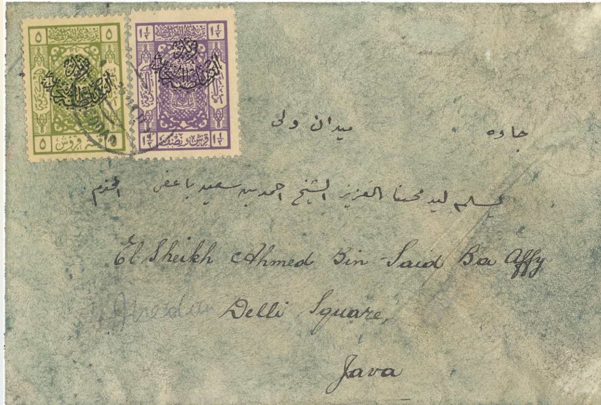
Possibly repaired cover with forgeries added.