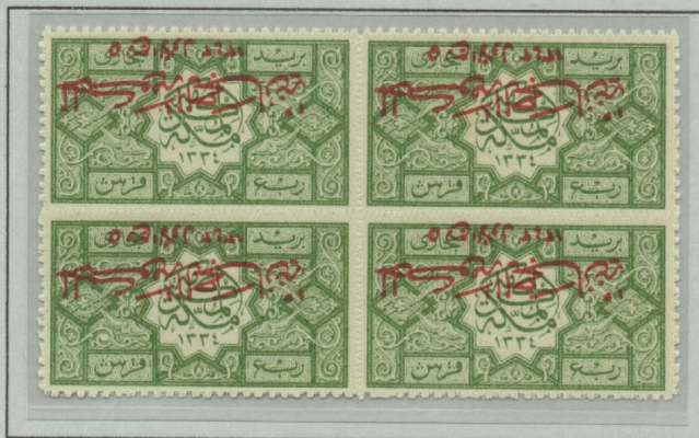
Posns 23-24, 28, 29