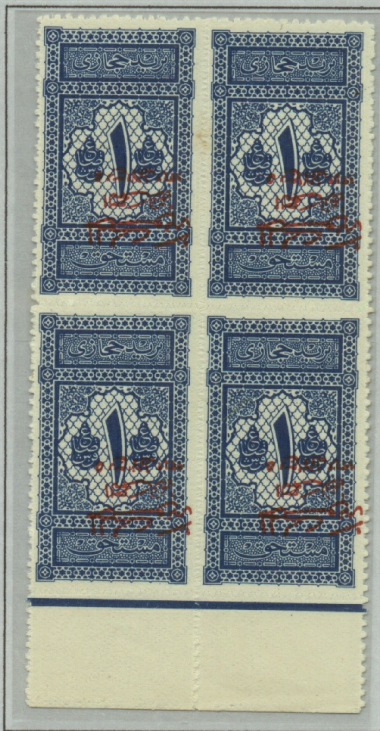
Posns 6-7, 16-17