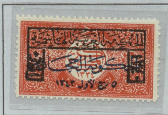
Posns 34 Signed RJT