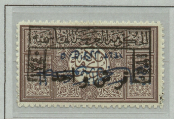
Posns Framed 17 Two Line 34