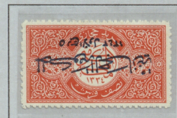
Position 37 Signed wak Warin reported 5 sheets