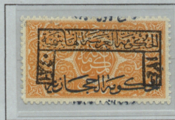
Posn 40 Signed ela, wak