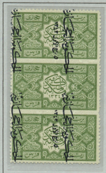
Posns 18-19, 23-24 Signed ela, wak