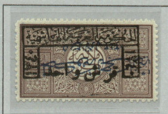
Posns Framed 45 Two Line 6