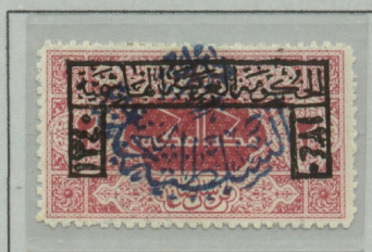
Framed Position 28 Signed A.EID

Warin reported that 950 stamps of each of the 1 piastre and 2 piastre were handstamped, and 1,200 stamps of the 1pi postage due