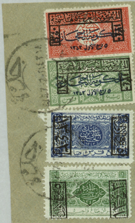
Type H20 Djedda cancel from the period of the siege

Jeddah was under siege by Abdul Aziz ibn Saud from late October 1924 until the surrender on December 19 th 1925.