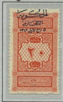
Posn 49 Signed wak 2 Sheets