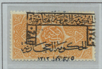
Posn 6 Signed ela, RJT