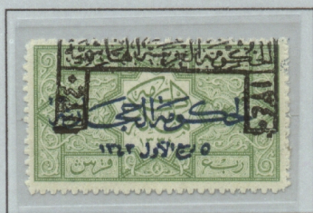
Posns 46 Signed DG