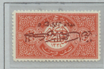
Position 39 Signed wak Warin reported 5 sheets