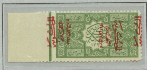
Posns 41 reading up 6 (&16) reading down

Warin records 50 copies of each of these varieties.