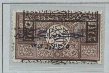
Posn 2 Signed RJT