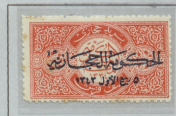
Position 38 Signed wak Warin reported 13 sheets.