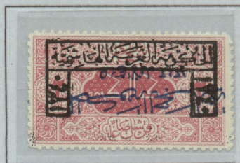
Posns Framed 39, Two Line 12 Signed wak

Although Warin reported a total of 10 sheets with the normal overprint these appear scarcer.