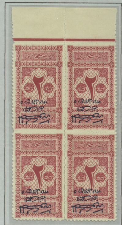
Posns 35-36, 45-46