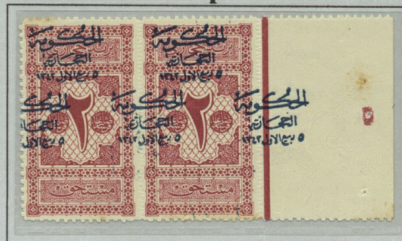
Posns 29 and 30 part 28 Signed wak

Warin records 50 copies (1 sheet) with double overprint