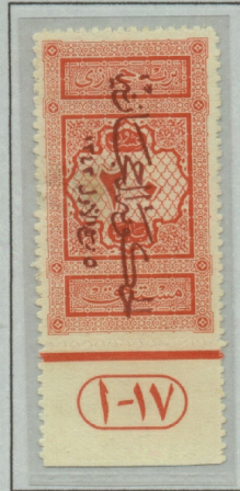
Posn 50 Signed DG Repaired Thin