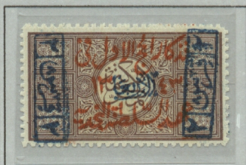
Signed A.EID & DG