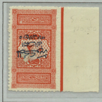
Posn 1 Signed RJT