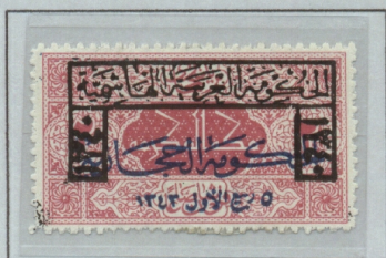
Posn 38 Signed DG