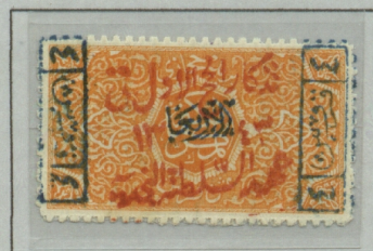
Signed A.EID & DG

Two stamps of the First Hejaz series were seized and subsequently surcharged with the new value in blue. Also overprinted in red "Commemorating the first Pilgrimage during the Sultanate of Nejd – 1343" and centrally in blue "Wednesday".