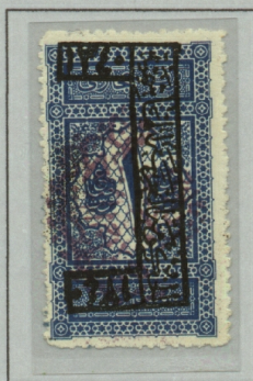
Framed Position 36 Signed A.EID

Warin reported that 950 stamps of each of the 1 piastre and 2 piastre were handstamped, and 1,200 stamps of the 1pi postage due