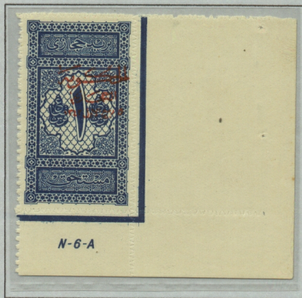
Pos 50 Warin Signed wak 24 Sheets

The small three line appears to have been specifically designed for the postage dues.