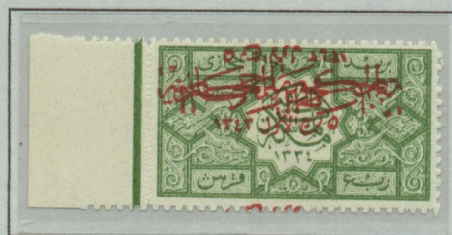
Position 6 up and 45 down