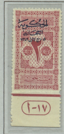
Posn 1 Signed wak 30 Sheets