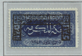
Posns 34 Signed wak